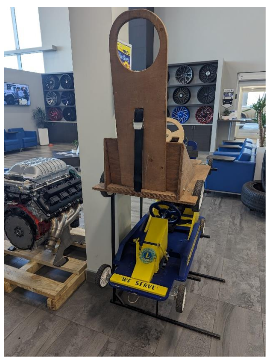
Hemi engine not included

Stay turned for more " carts around town " – promoting our sponsors and supporters. You can see some designs on the website YouTube channel <u>here</u>.