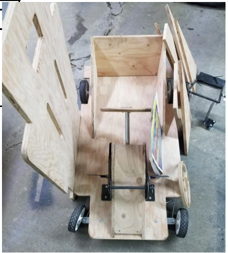
Build Kit Plus parts with resulting cart